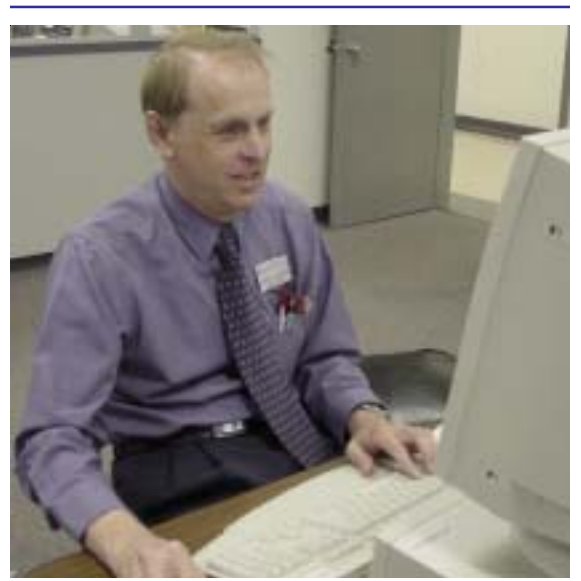
We do Windows® 2003!

At NNSS, our philosophy of network administration is simple: A well designed and administered network infrastructure is one that, for the most part, is invisible to the end users. It does not interfere or complicate the end users' work load. Instead, it ought to enhance their work environment so they can complete their assigned tasks in the most efficient and cost effective manner possible. In the corporate world, "Time Is Money!" and a poorly designed and/or administered network will actually increase the cost of doing business and, therefore, decrease the bottom line for the company and its stakeholders! Therefore, having your network properly designed, deployed, and administered will increase the efficiency of your employees, result in a higher level of employee morale, will give you a faster return on the investment (ROI) of the cost of deploying the network, and create a higher profit margin for your stakeholders!